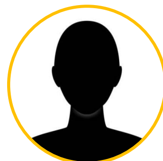
To be Appointed Head of Department, Architecture

Monash University is committed to building and maintaining a sound ethical culture, one which demonstrates integrity and respect. The University fosters an environment of honesty, fairness, and mutual respect.