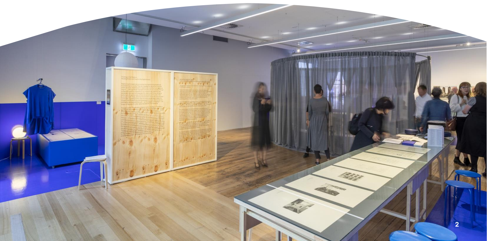
Exhibition by Jacqui Alexander: 'Dwelling on the Platform: Housing Access and Equity in the Digital Society' 2023

The deadline for receipt of applications is midday 1 November 2024 AEST